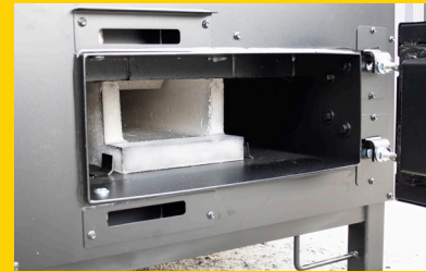
TOP: BACK ACCESS PANEL