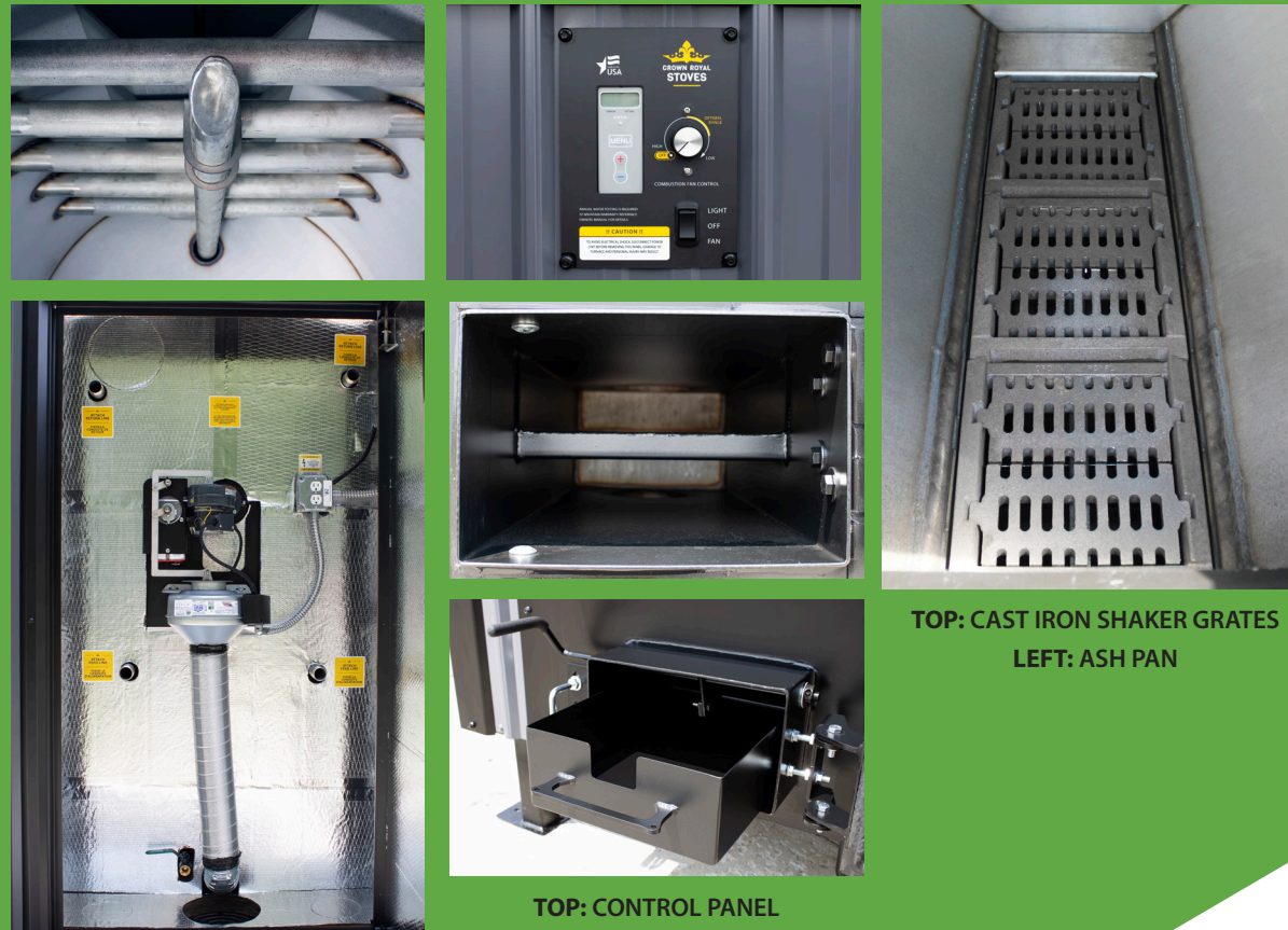
TOP: CAST IRON SHAKER GRATES LEFT: ASH PAN