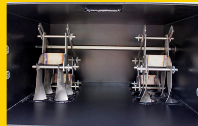
TOP & MIDDLE: SECONDARY COMBUSTION CHAMBER & HEAT SHIELD